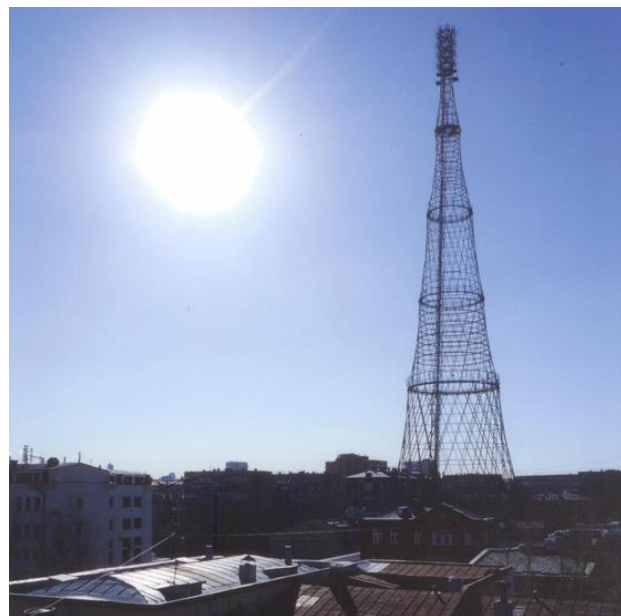
Illustrations title: Umlauftank II Berlin, back: Shukhov Tower Moscow

ICOMOS Germany Brüderstr. 13 10178 Berlin ICOMOS@ICOMOS.de